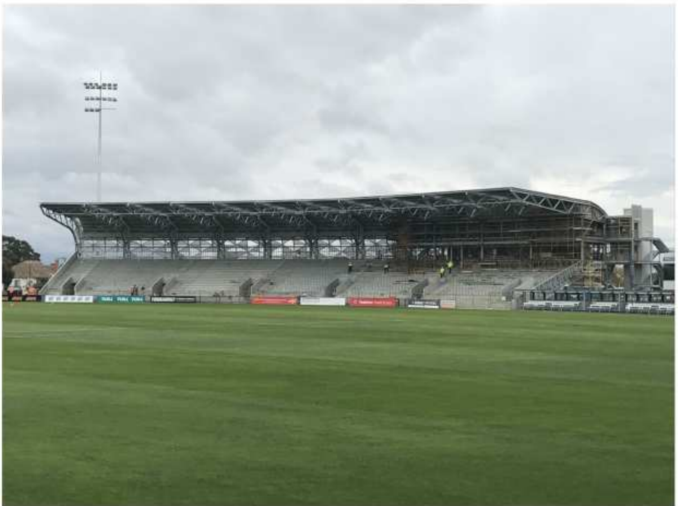
Construction of new Eureka Stadium Grandstand Ballarat